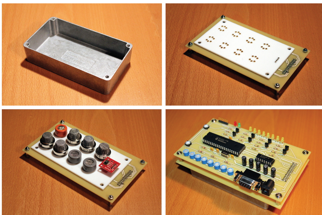
Fig. 1. The prototype of the realized device

Our tests have been carried out with the prototype device realized in the Biomedical Instrumentation Laboratory of the faculty of Physics at the Altai State University, showed in Fig.1. It is constituted by eight different gas sensors, one transducer of humidity and temperature, enclosed in an aluminum container in which, through two holes, the exhaled air circulates. Externally there is the control circuit, constituted by a Microchip PIC microcontroller, which digitally converts the measured values of gas concentration of every transducer and eventually computes the temperature and humidity correction. The microcontroller (Microchip PIC18F2520) is a high performance RISC CPU, based on a modified Harvard architecture operating up to 5 MIPS with analog features.